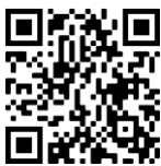
Chico General Plan