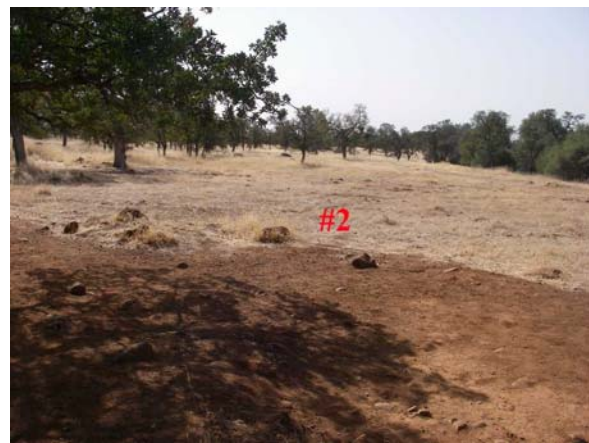
#2: 39.778006, -121.733857- Just west of Tee 1 area.