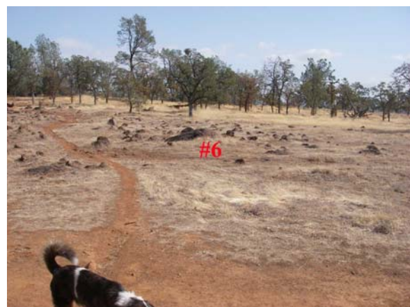
#6: 39.779617, -121.733428- Near large rock, visible from where trail emerges onto short course.