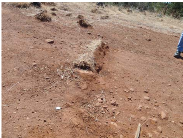
Reference point 3: Previous bench location at Tee 2.