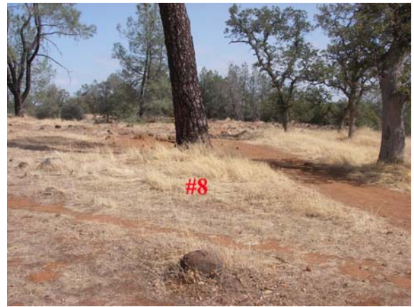
#8. 39.780032, -121.732337- Near Ponderosa Pine, central portion of short course.