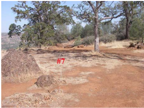
#7. 39.780015, -121.732975- Between tree and large rock, between holes near cliff.