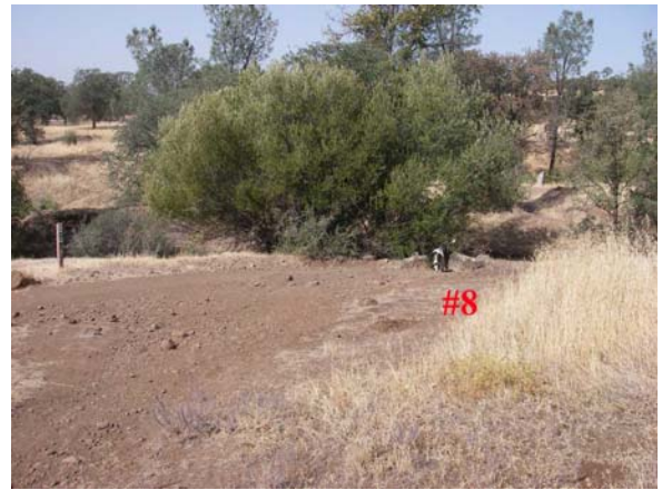
#8. 39.772687, -121.776967- Lower Trail where path intersects from east.