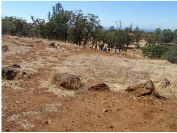
Reference point 1: Looking West from Tee 2.