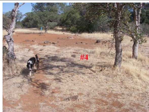
#4: 39.778731, -121.733888- Near Target 1, between 3 trees and Target area.