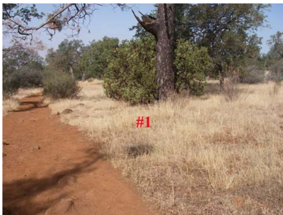
#1: 39.777470, -121.732691- Near Ponderosa Pine between Kiosk and Target 18.