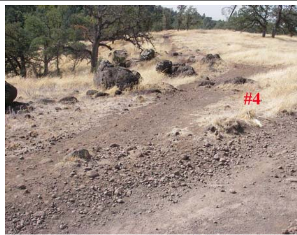
#4: 39.773250, -121.775237- Between Middle Trail and connector to Lower Trail.