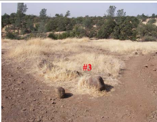
#3: 39.772960, -121.776182- Fork of middle trail and other trail, in triangle between trails.