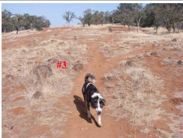
#3: 39.778364, -121.733898- Center of Fairway 1, adjacent to largest rock in fairway.