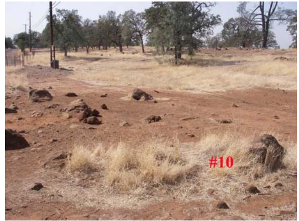
#10. 39.779753, -121.731461- Just east of Tee 1 area.