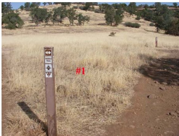
#1: 39.773646, -121.778018- Triangle where path from parking lot meets Middle Trail.