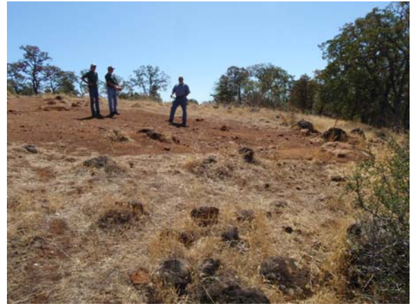
Reference point 2: Looking North from below Tee 2.