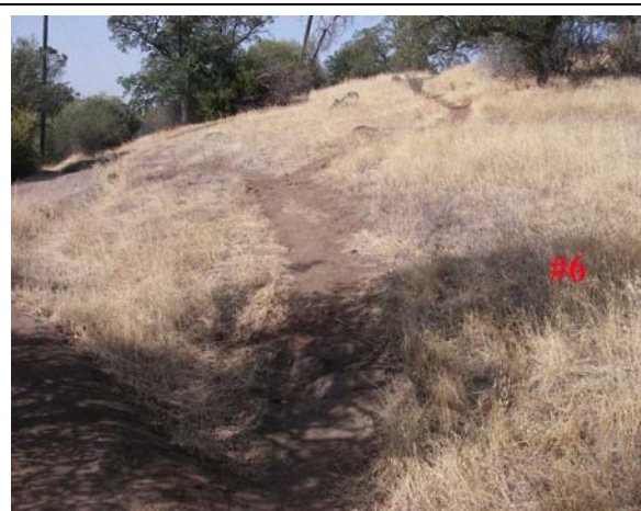
#6: 39.772478, -121.775260- Up hill from connector trail and Lower Trail fork.