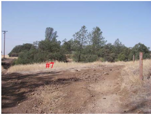
#7. 39.772061, -121.776800- Lower Trail turns north, point is in triangle with other paths.