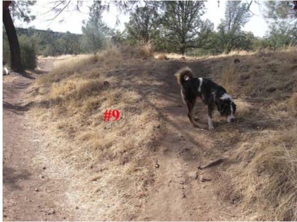
#9. 39.772980, -121.777619- Lower Trail where path shortcuts to parking lot.