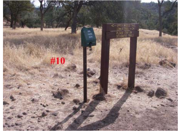
#10. 39.772951, -121.778285- Just behind trails sign and pet waste bag station.