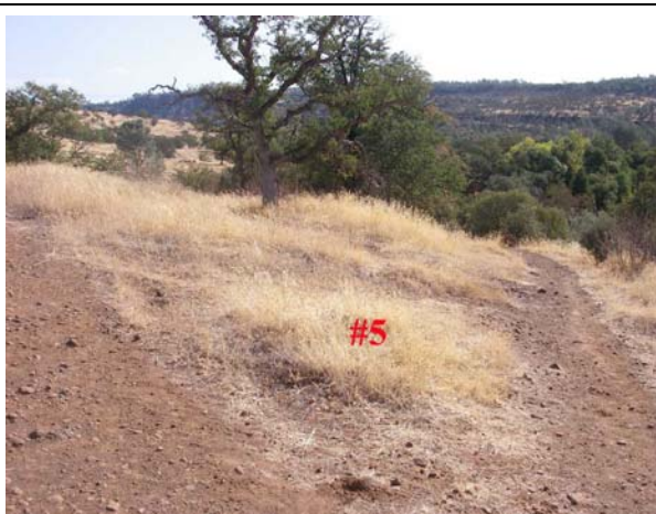
#5: 39.772519, -121.775946- Switchback on connector trail from Middle to Lower Trail.