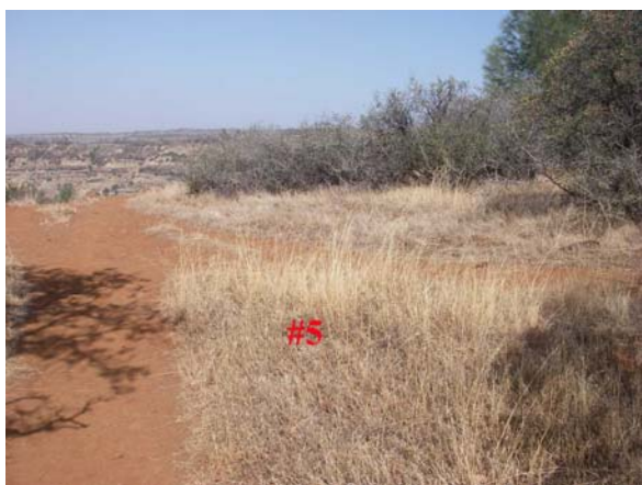
#5: 39.779274, -121.734067- Between Target 1 and Tee 2, where trail forks and leads to short course.