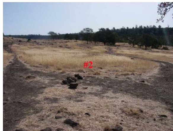
#2: 39.773824, -121.777590- just east of first creek crossing, middle trail is shown on right.